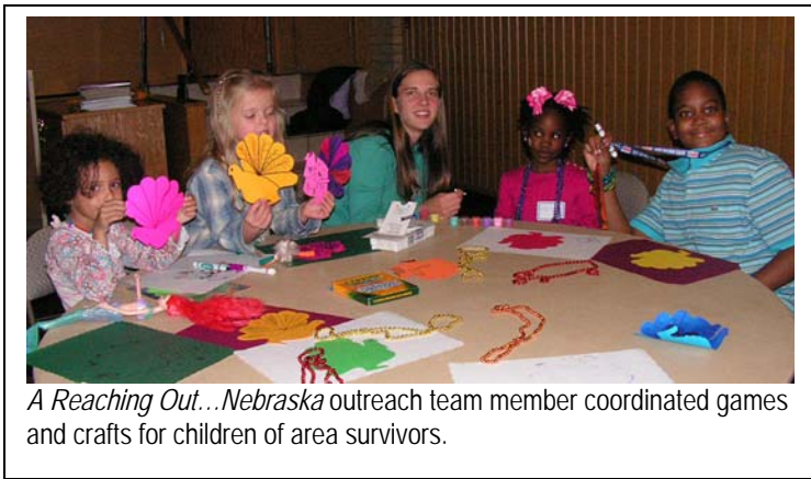
A Reaching Out...Nebraska outreach team member coordinated games and crafts for children of area survivors.

the presentation was to educate community members about the ongoing needs of evacuees.