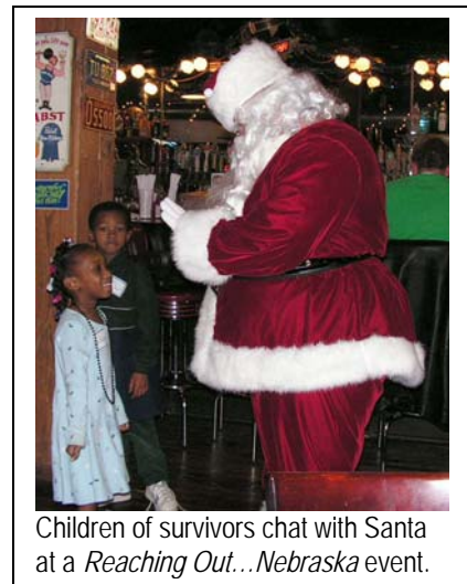
Children of survivors chat with Santa at a Reaching Out...Nebraska event.

December 18, 2006 Holiday Event at Henry Doorly Zoo Between 80-100 Lincoln and Omaha-area survivors attended a day long visit to the Omaha Zoo. The event was