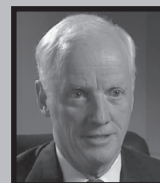
Gov. Frank Keating OK City Bombing