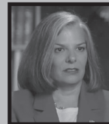
Dr. Julie Gerberding SARS