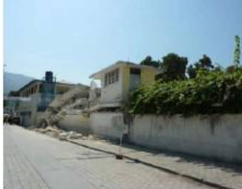
Fig. 5-11 Ecole d'infirmières et au fond le bâtiment pédiatrie