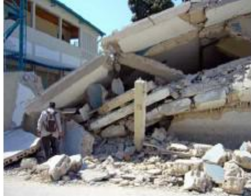
Fig. 5-12 Ecole d'infirmières