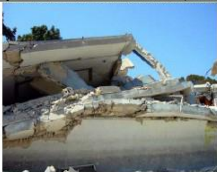
Fig. 5-13 Ecole d'infirmières