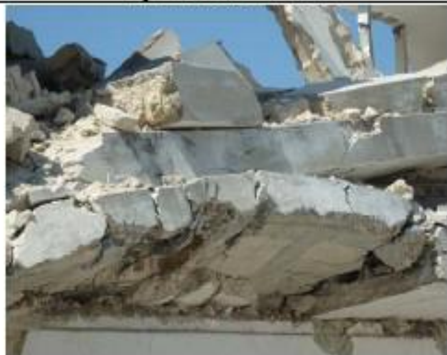
Fig. 5-14 Ecole d'infirmières